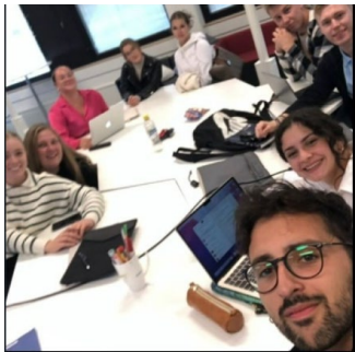
Working in student teams

Finishing the project; Results for companies & evaluation